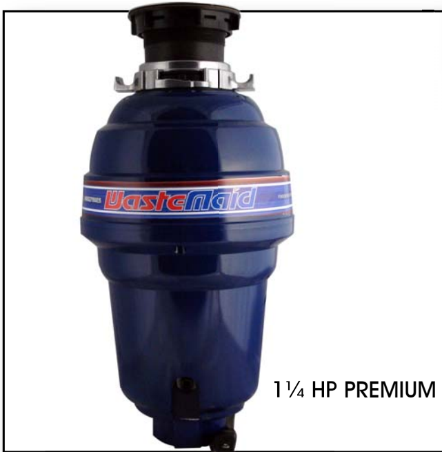
1 1/4 HP PREMIUM