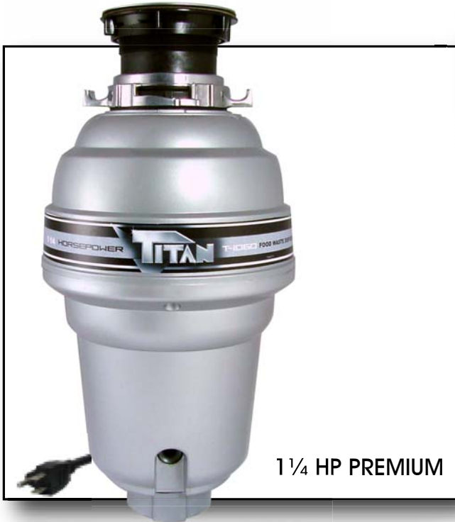
1 1/4 HP PREMIUM

THE TORQUE MASTER GRINDING SYSTEM is a combination of computer designed and balanced components working in unison to provide superior torque grind speed and long system life.