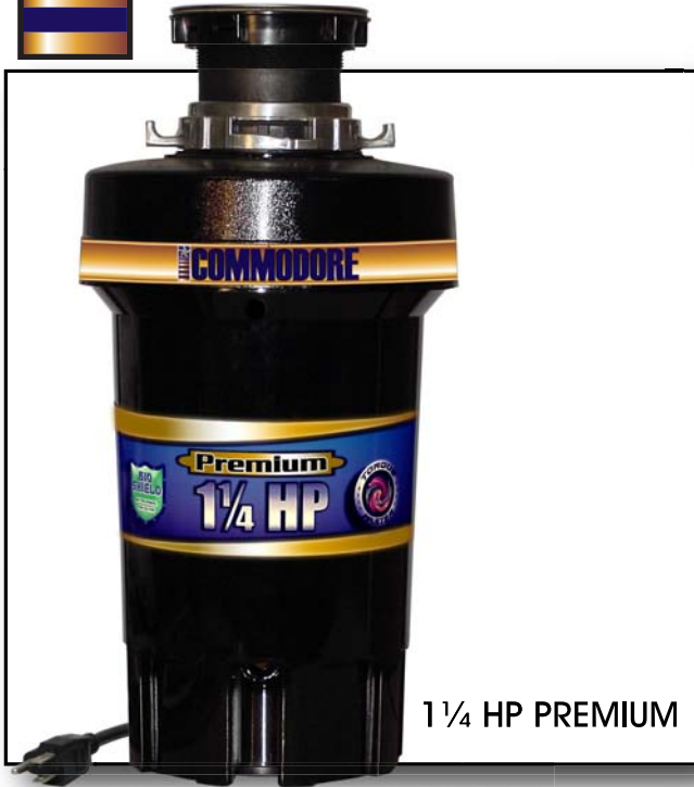
1 ¼ HP PREMIUM

THE TORQUE MASTER GRINDING SYSTEM is a combination of computer designed and balanced components working in unison to provide superior torque grind speed and long system life.