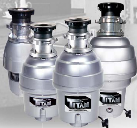
Batch Feed Units