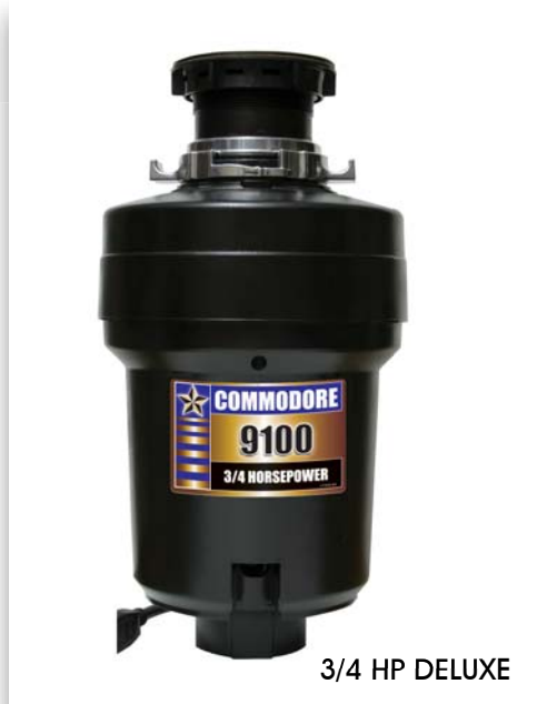
3/4 HP DELUXE