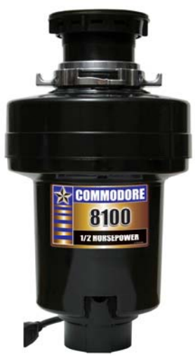
1/2 HP HEAVY DUTY