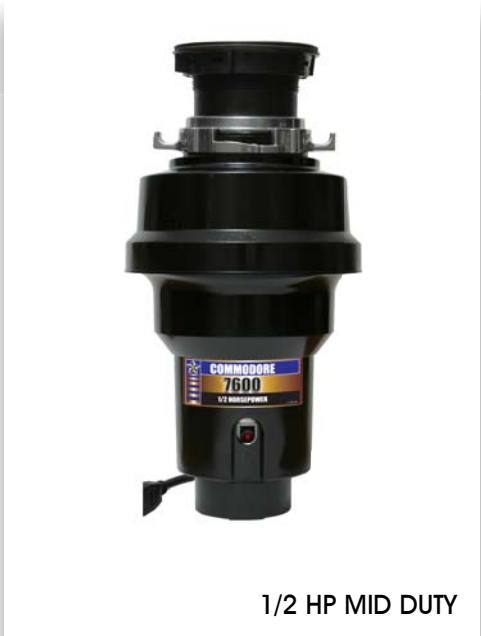
1/2 HP MID DUTY