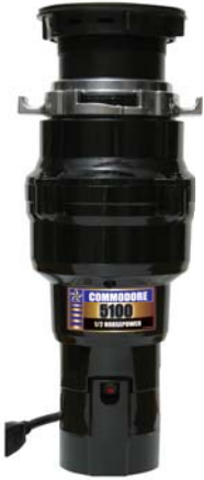
1/2 HP ECONOMY