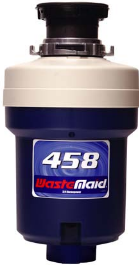
3/4 HP DELUXE