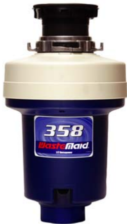
1/2 HP HEAVY DUTY