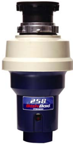
1/2 HP MID DUTY