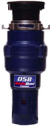
1/2 HP ECONOMY